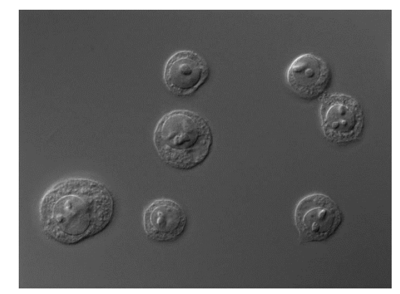
Fig3 – Rounded-up HeLa cells, which occur when the cells are entering mitosis, preparing to divide.

Preliminary data, prior to starting this summer research project, showed that rho-kinase inhibitor drugs have a marked effect on Drosophila embryonic growth, reducing the rate. Alongside other studies' results stating that ROCK inhibitors reduce rate of cell proliferation, the project would therefore investigate whether these drugs can effectively reduce the rate of human HeLa cell growth, and therefore delay progression of proliferative cell conditions i.e. cancer. The drugs studied in the preliminary data, and so investigated in my project were Y-2, HA-1077 and 962B. Each drug was applied at 25mM.